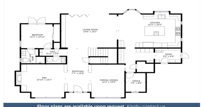
Floor plans are available upon request. Nindiy contact us.